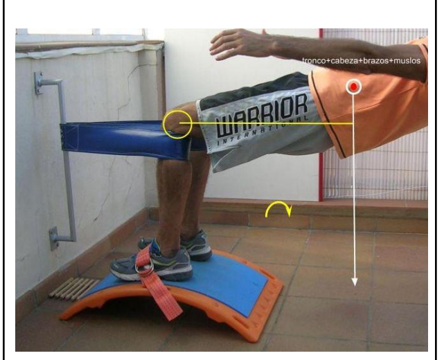
Clockwise moment of force of the trunk+head+arms+thighs system in relation to the knee.