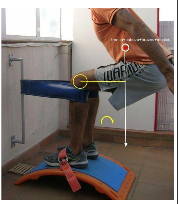
Clockwise moment of force of the trunk+head+arms+thighs system in relation to the knee.

The hamstrings in their flexo-retroversion action are practically in postural tone without relevant participation; although with the trunk inclined, being more extended, its activation is greater than with the trunk vertical.