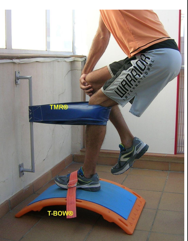
Squat a una pierna con apoyo en plano horizontal.