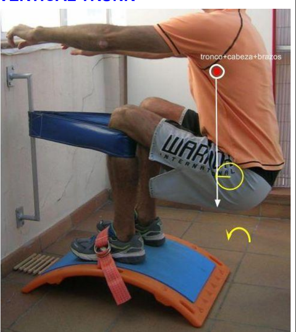
Counterclockwise moment of force of the trunk+head+arms system in relation to the hip.