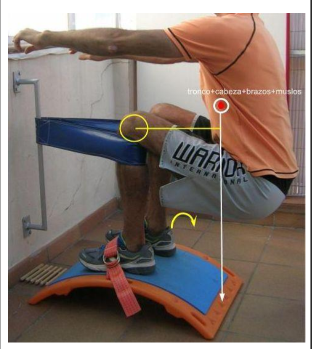
Clockwise moment of force of the trunk+head+arms+thighs system in relation to the knee.