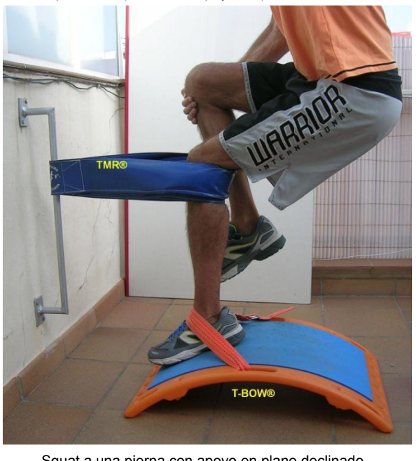
Squat a una pierna con apoyo en plano declinado.